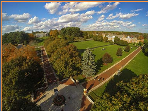
Stonehill College, Easton, MA